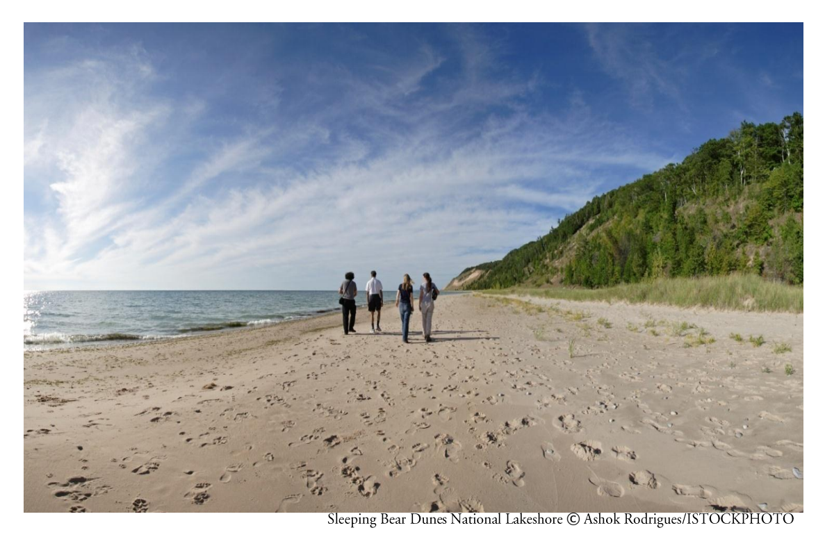
Restoring our National Parks by Restoring our Great Waters

Water gives life to our national parks, shaping land and sustaining life. From Acadia to the Grand Canyon, Everglades to Olympic, water is central to features, wildlife, recreation, aesthetics, and visitor enjoyment.