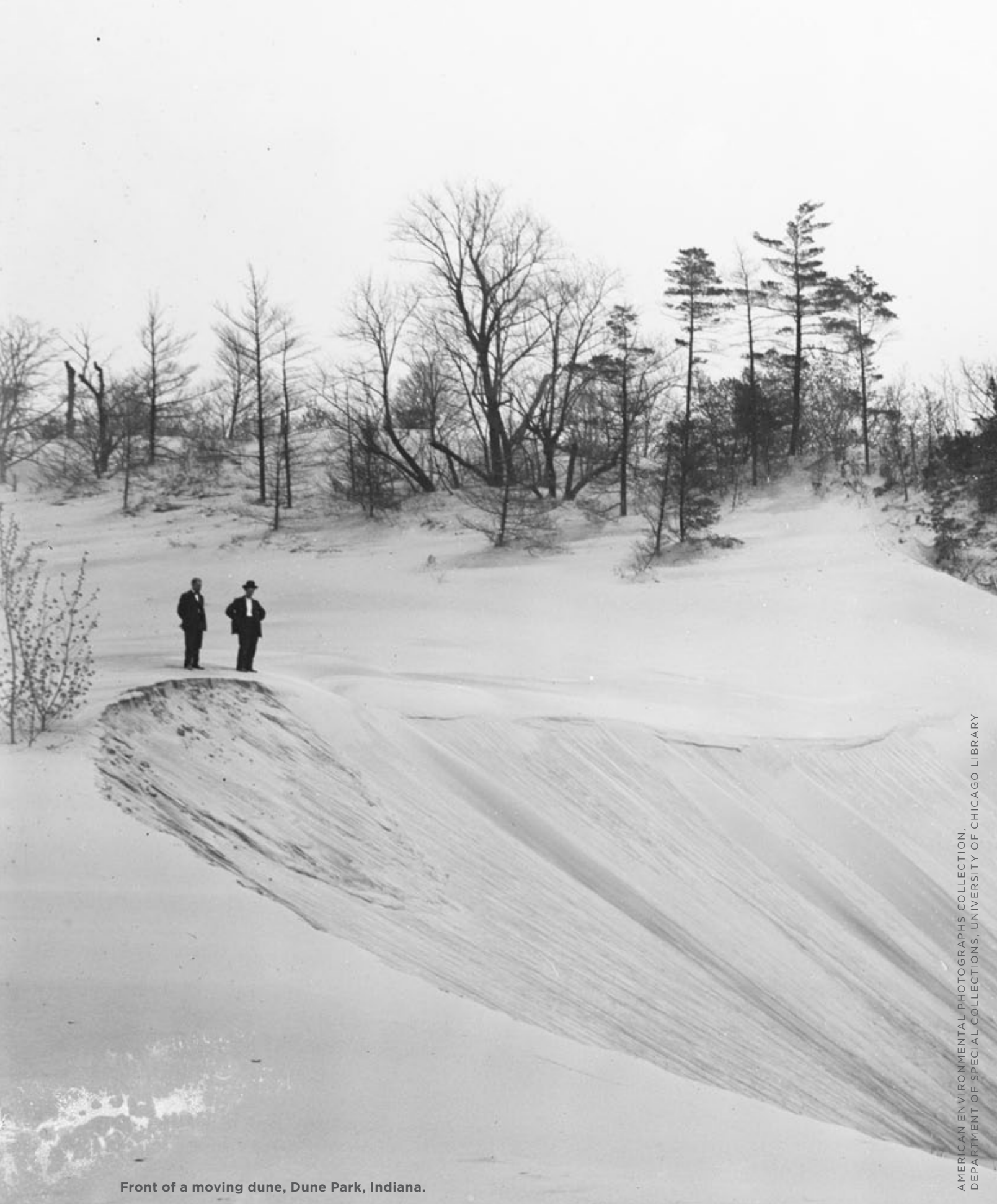
Front of a moving dune, Dune Park, Indiana.