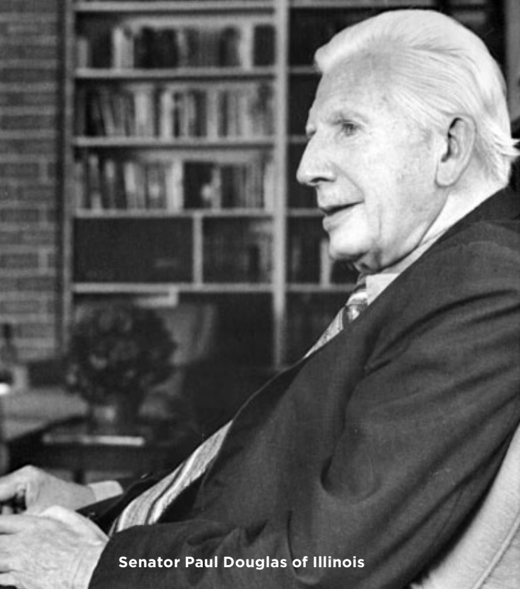
Senator Paul Douglas of Illinois