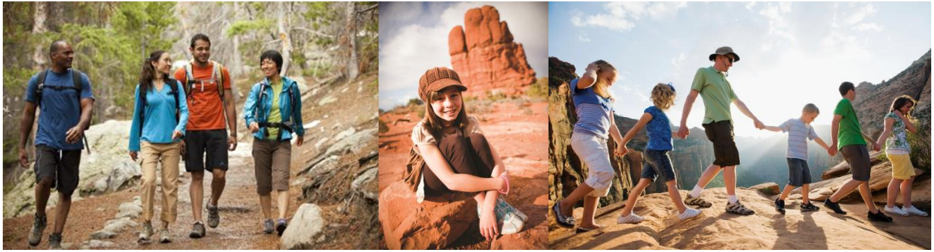
In order (L to R): © Dana Romanoff, © Todd Keith, © Tetra Images/Alamy