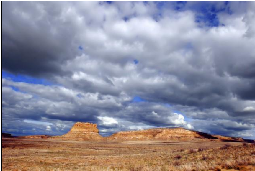
Fajada Butte at Chaco Culture NHP at sunset

The BLM is hosting a methane forum in Albuquerque, NM on Wednesday, May 7, 2014 from 1-4pm at the National Indians Training Center, 1011 Indian School Road NW, Albuquerque NM