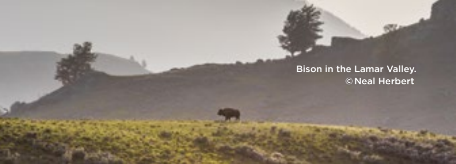
Bison in the Lamar Valley.