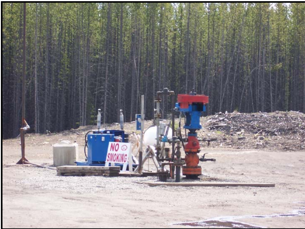
Photo 24. Encana/StormCat exploratory CBM well site.