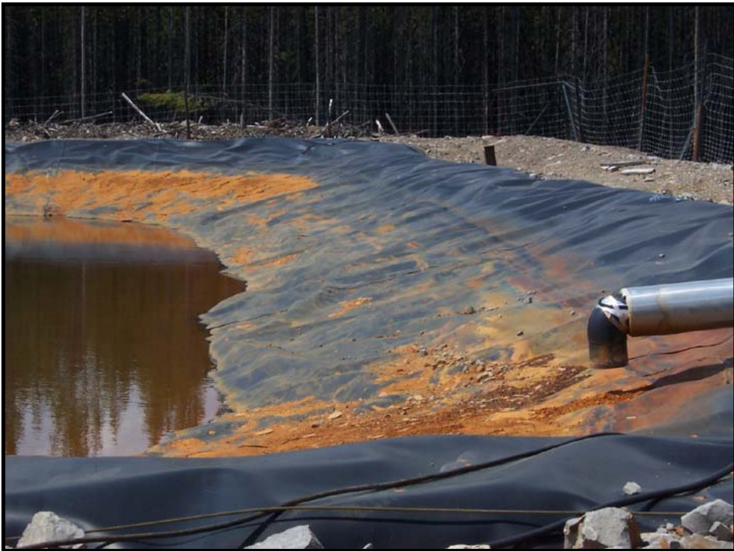
Photo 20. Iron deposits at an Encana/StormCat CBM wastewater settling pond, Elk Valley, British Columbia.