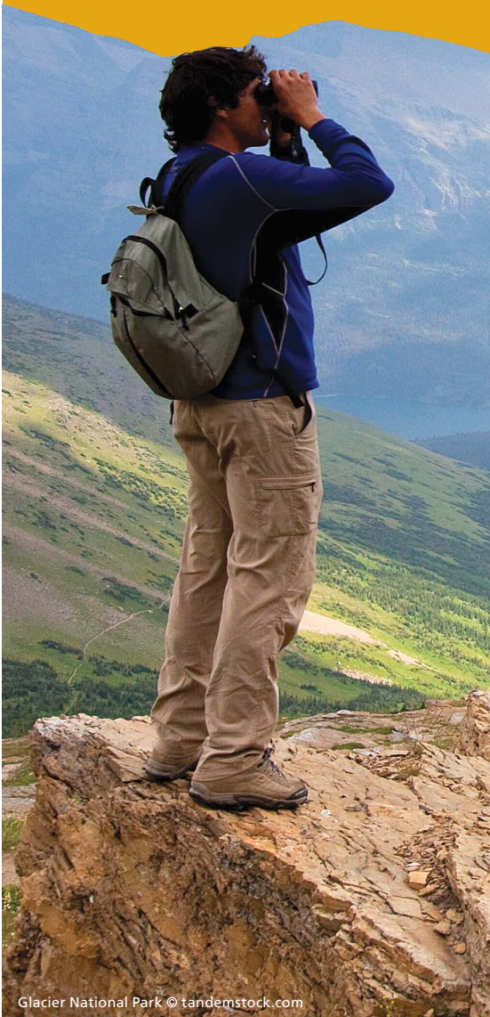
Glacier National Park

In 1932, Glacier—in conjunction with adjacent Waterton Lakes National Park in Canada—was designated the world’s first international peace park, now a UNESCO World Heritage Site. But the magic of the broader 18-million-acre Crown ecosystem lies in the sum of small things found nowhere else: a wolverine careening down a snowfield in Montana’s Bob Marshall Wilderness; a white bark pine tree 33 feet in circumference, clinging to a cliff in British Columbia’s backcountry; and peaks so rugged few people have ever summited them, the rocky backbone of this world where BC, Alberta and Montana meet high on the Continental Divide.