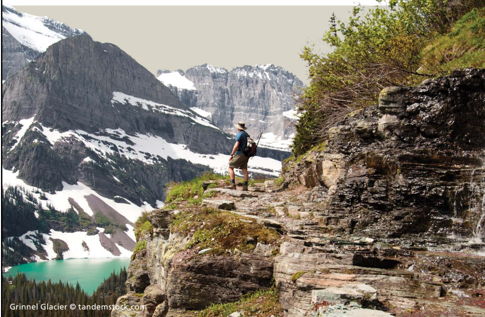
Grinnel Glacier

could also be a model of large-scale, transboundary conservation, proving that it’s possible to bring together diverse communities and cultures to protect a wild place with economic, cultural and even spiritual value—which is, in the end, priceless. 🐾