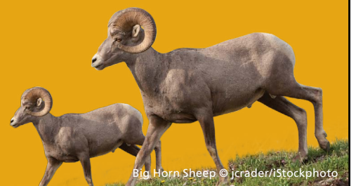
Bighorn Sheep

churches. Through these unusual coalitions, we identify the values—wild open spaces such as Glacier Park—that bind us together as a community, and we build irrefutable support for conservation goals that legislators can't ignore.