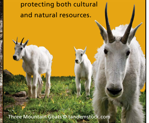
Three Mountain Goats