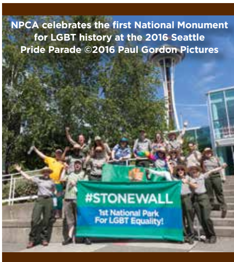
NPCA celebrates the first National Monument for LGBT history at the 2016 Seattle Pride Parade

The National Parks Conservation Association is a key player in these successes. Thank you for your support of our national parks! Washingtonians know that participating in activities and opportunities in these remarkable places can lead to lasting memories, an abiding sense of identity and a growing outdoor recreation economy. Your work to protect them is so important to achieving these goals.