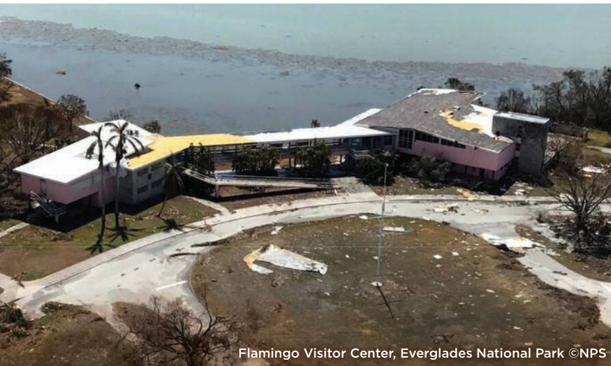
Flamingo Visitor Center, Everglades National Park

Among the most severely damaged: a 55-foot section of the moat wall at Fort Jefferson at Dry Tortugas National Park; visitor centers on the Gulf Coast and at Flamingo at Everglades National Park; and park buildings, boardwalks and docks at Biscayne National Park.