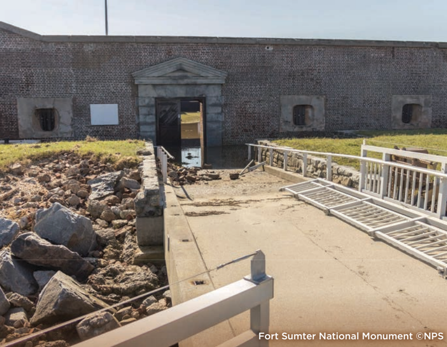
Fort Sumter National Monument