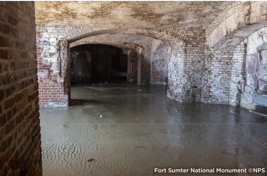
Fort Sumter National Monument