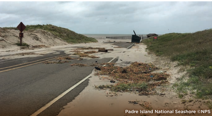
Padre Island National Seashore

Big Thicket National Preserve suffered unprecedented flooding, damaging miles of trails, roadways and bridges.