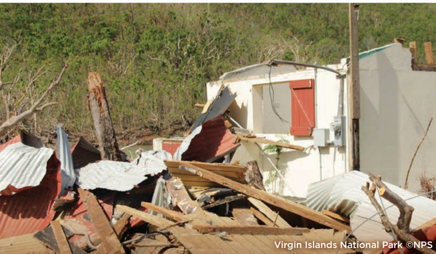
Virgin Islands National Park

At Virgin Islands National Park on St. John, park staff housing, park facilities and some of the oldest historic structures were destroyed. The damage is so extensive that the park could be closed for an entire year.