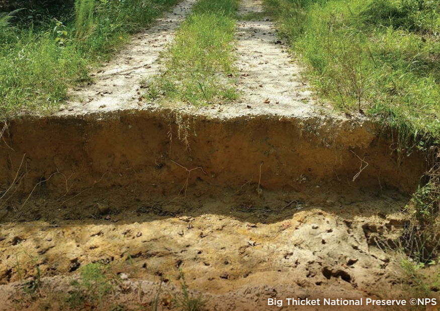
Big Thicket National Preserve