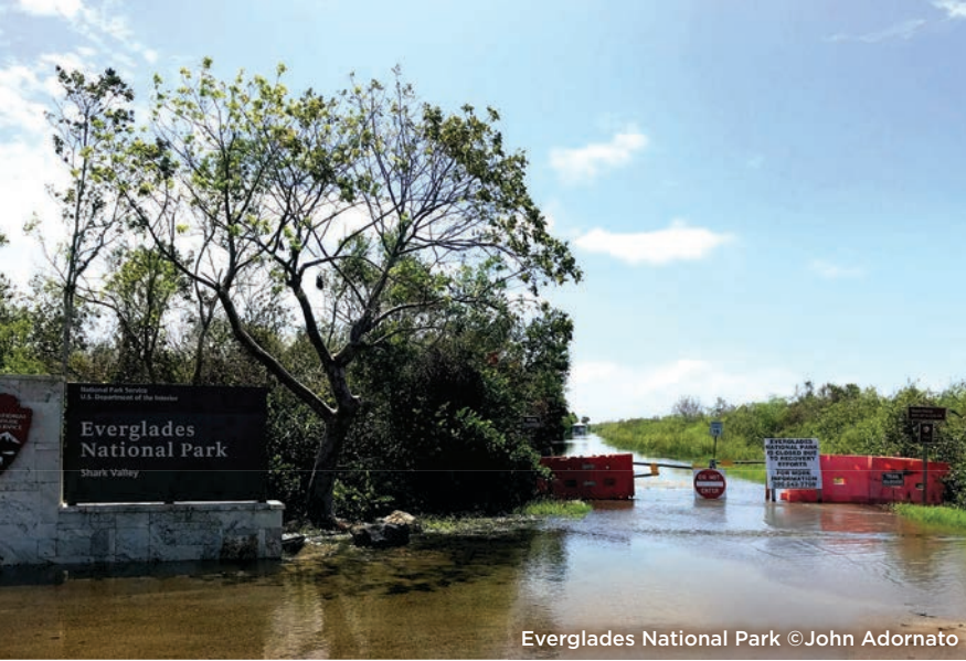
Everglades National Park