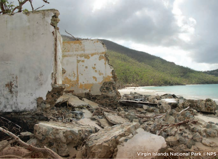
Virgin Islands National Park