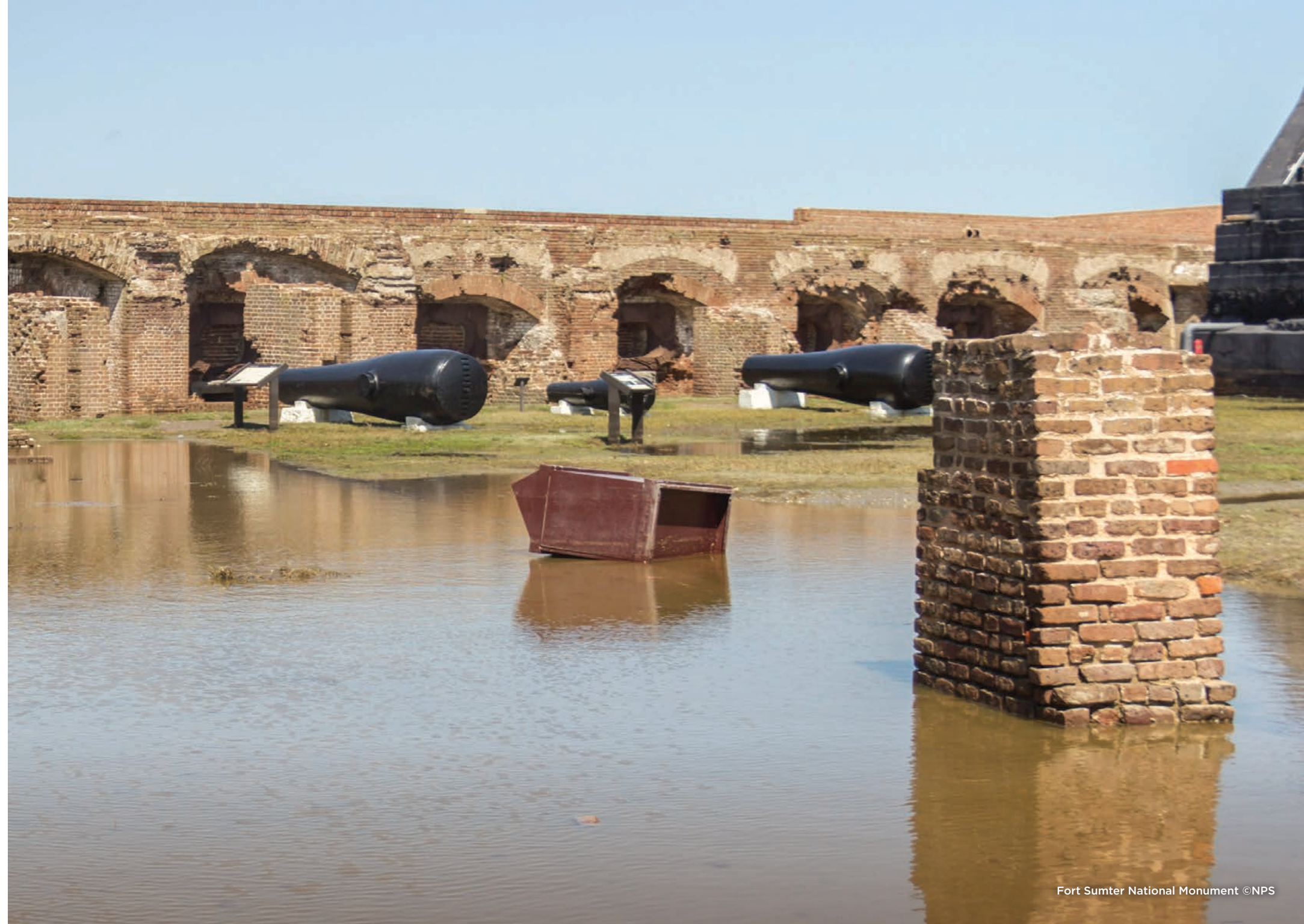
Fort Sumter National Monument

Fort Sumter closed for nearly two weeks with damage to the dock, dock railings and septic system.