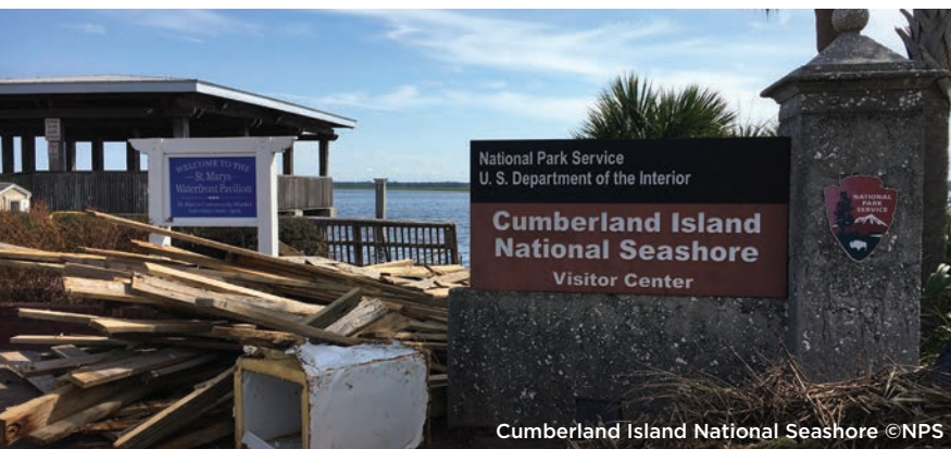
Cumberland Island National Seashore

At Cumberland Island, the docks in St. Marys for the park ferries were destroyed and one of the ferries sank. The park closed for an extended period and canceled camping reservations for months.