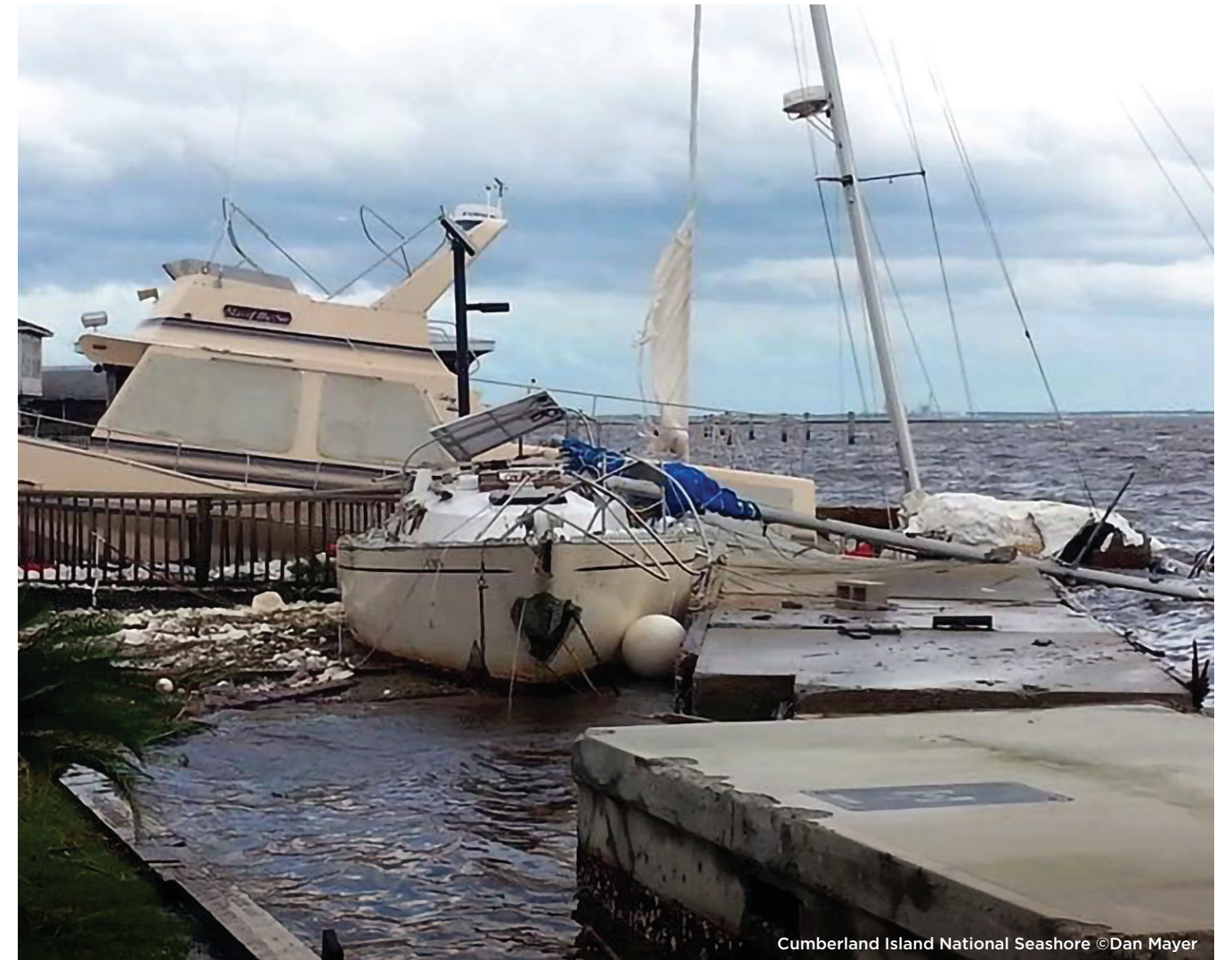
Cumberland Island National Seashore

Andersonville National Historic Site • Chattahoochee River National Recreation Area • Cumberland Island National Seashore Fort Frederica National Monument • Fort Pulaski National Monument Jimmy Carter National Historic Site • Ocmulgee National Monument