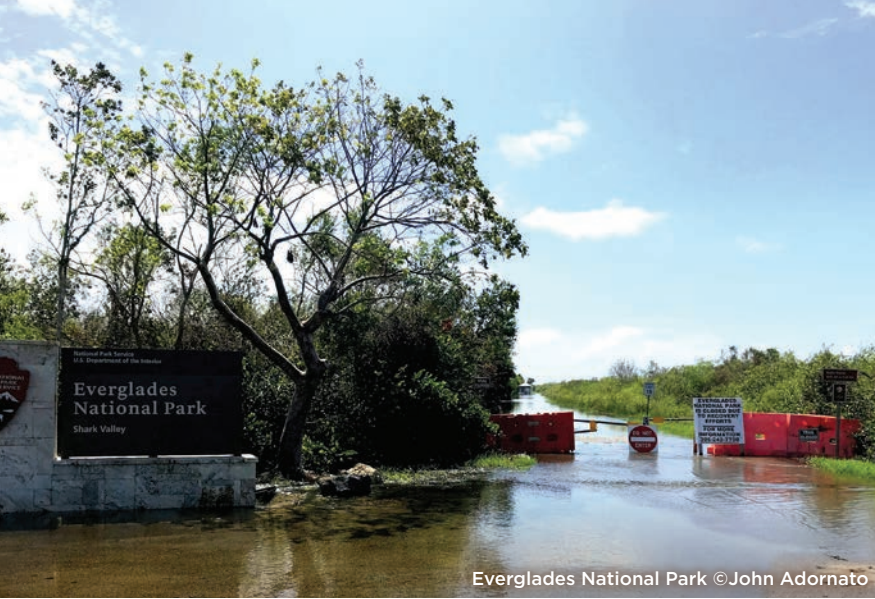
Everglades National Park