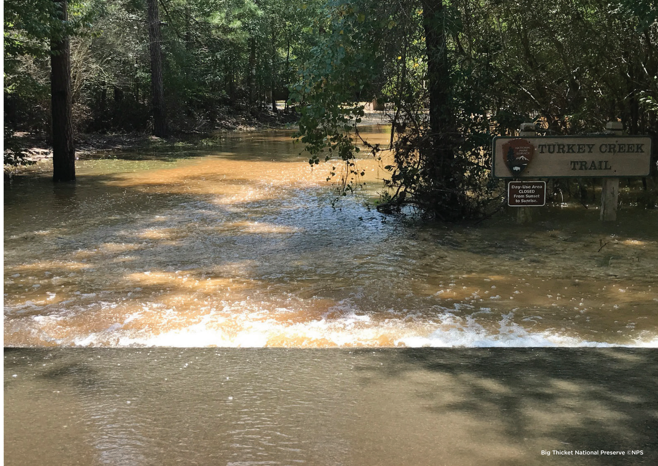
Big Thicket National Preserve

Padre Island National Seashore experienced severe coastal flooding and erosion, resulting in damages to boat ramps and campgrounds.