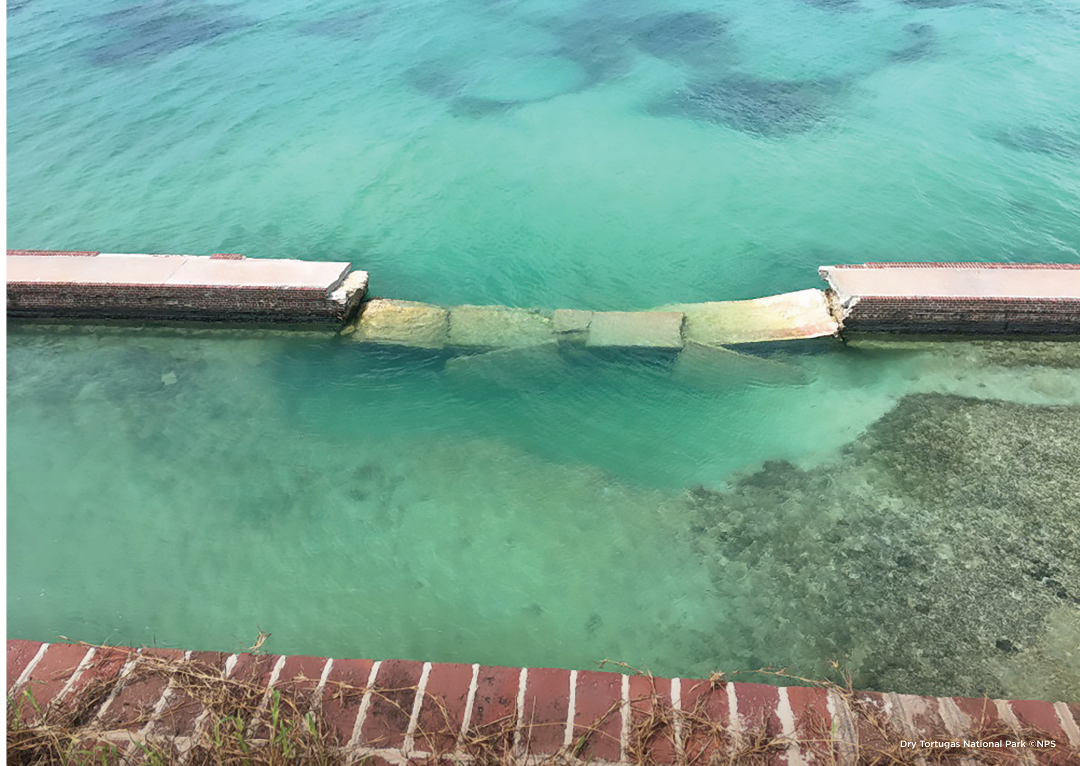
Dry Tortugas National Park

Among the most severely damaged: a 55-foot section of the moat wall at Fort Jefferson at Dry Tortugas National Park; visitor centers on the Gulf Coast and at Flamingo at Everglades National Park; and park buildings, boardwalks and docks at Biscayne National Park.