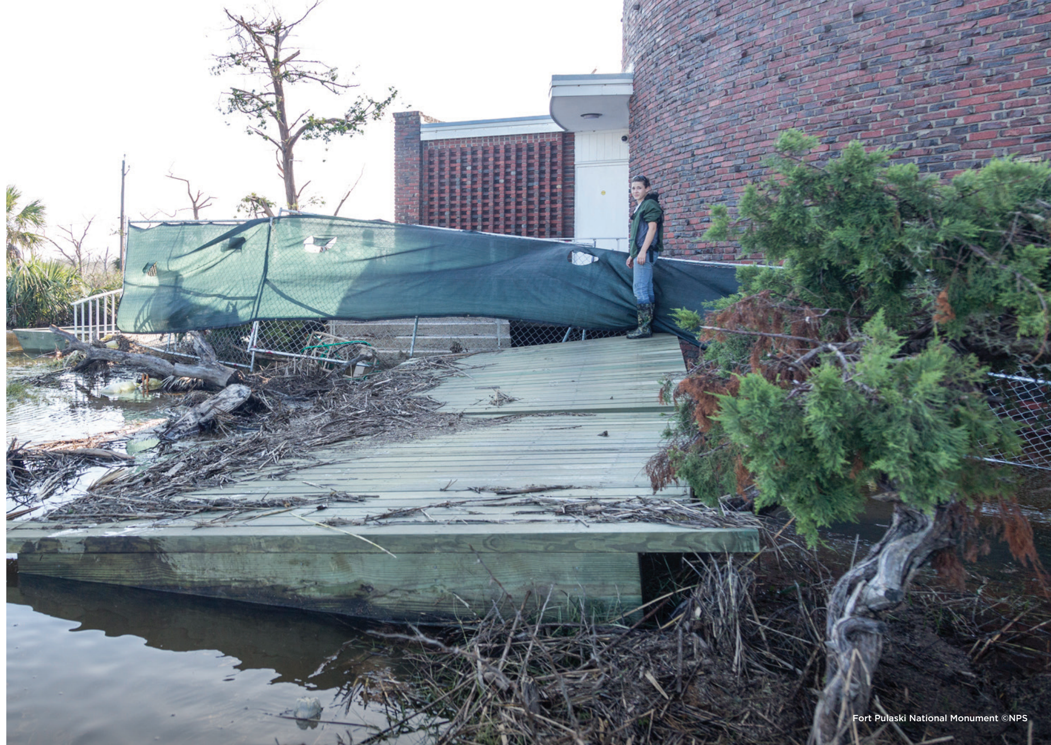
Fort Pulaski National Monument

At Fort Pulaski, the cumulative impacts from Hurricane Matthew in 2016 and Irma in 2017 have damaged every building throughout the park, including extensive damage to the fort roof, drawbridges and water tank.