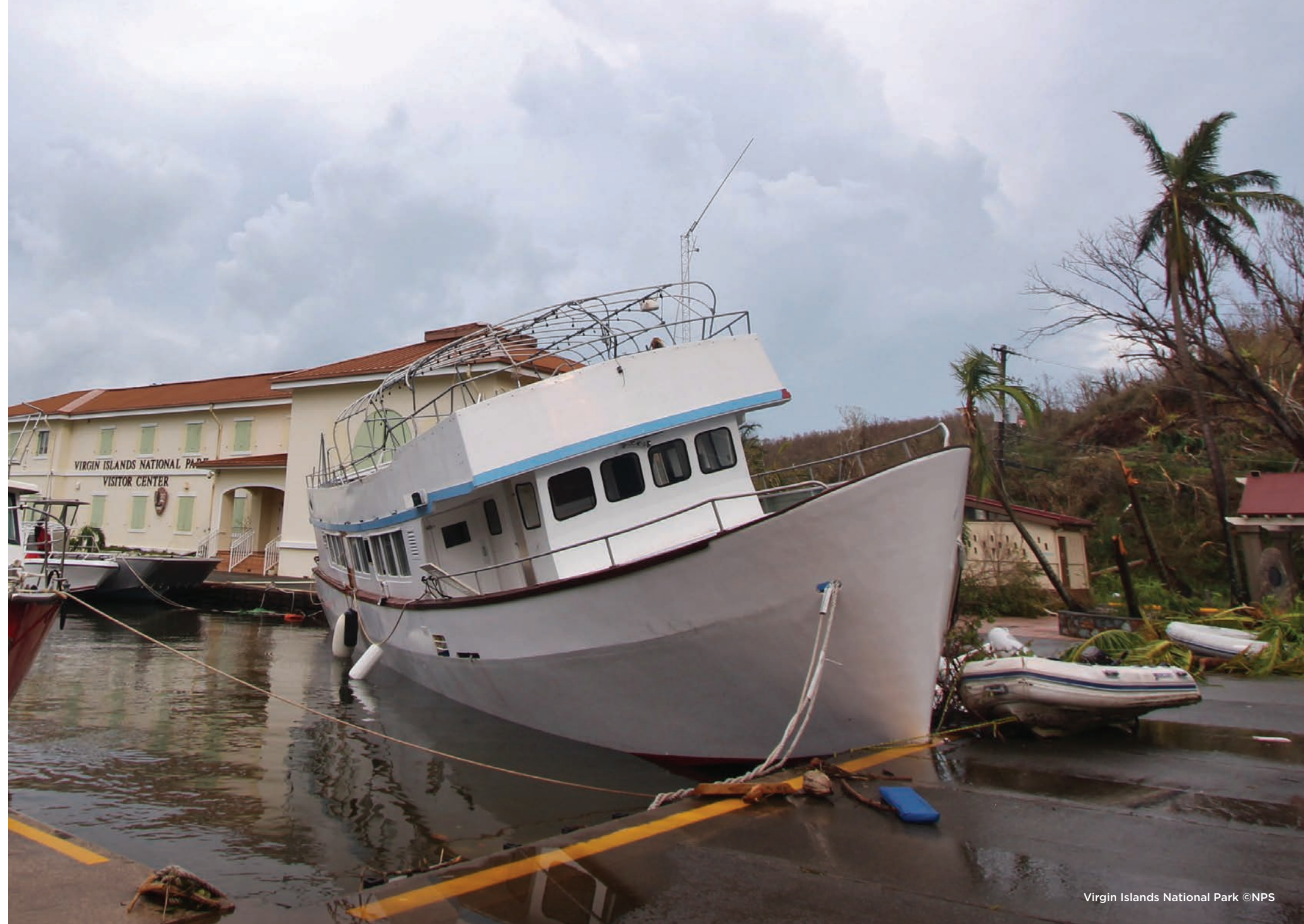
Virgin Islands National Park

At Virgin Islands National Park on St. John, park staff housing, park facilities and some of the oldest historic structures were destroyed. The damage is so extensive that the park could be closed for an entire year.