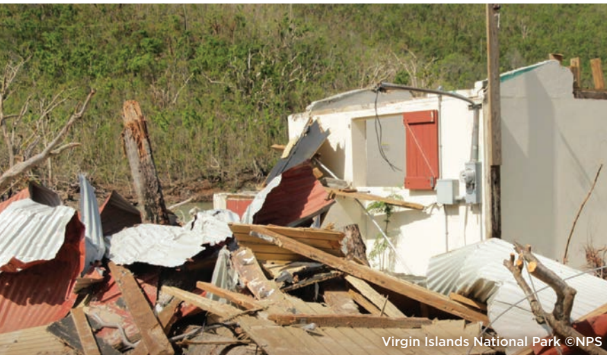
Virgin Islands National Park

At Virgin Islands National Park on St. John, park staff housing, park facilities and some of the oldest historic structures were destroyed. The damage is so extensive that the park could be closed for an entire year.