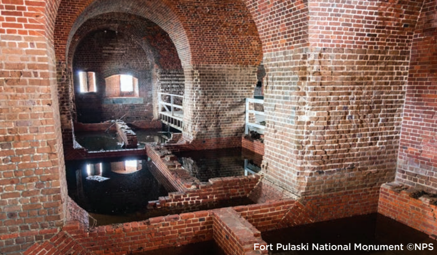
Fort Pulaski National Monument