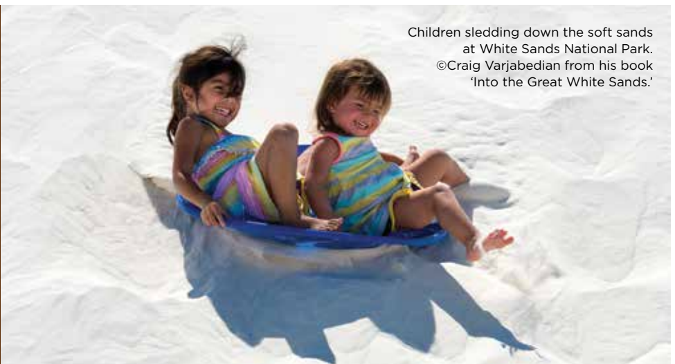
Children sledding down the soft sands at White Sands National Park.

White Sands now shares a similar origin story as several other treasured national parks, from Grand Canyon to Grand Teton, in which a national monument established by presidential proclamation under the Antiquities Act becomes so cherished by the public and the local community that Congress redesignates it as a full-fledged national park. We hope to see the same someday for other national monuments.