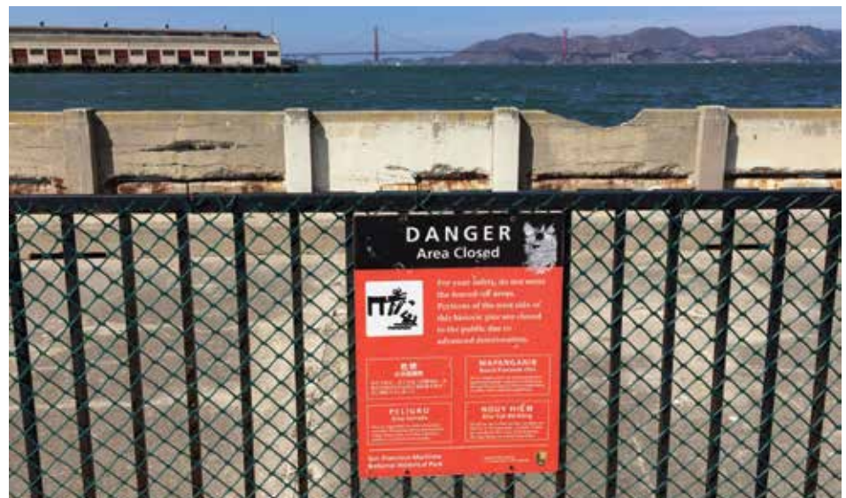
Left: Damaged road, Hawaii Volcanoes National Park Below: San Francisco Maritime Municipal Pier

advocates have spoken out time and again to advance both critical programs. The legislation’s bipartisan support is the culmination of two decades of work, thousands of emails and phone calls, hundreds of trips to Capitol Hill offices, and a shared love for America’s heritage.