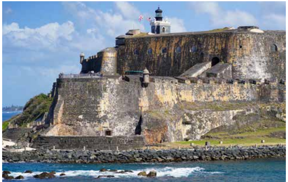
Top: Nesting habitat for the sooty tern at Dry Tortugas National Park is threatened by sea level rise Above: Fort San Felipe Del Morro in San Juan National Historic Site is an historic structure that is susceptible to climate impacts

Many of these species have evolved to adapt to specific fresh- or brackish- water environments and hydrological conditions present across our diverse Everglades wetlands and uplands, and thus may be impacted or displaced by species that can tolerate climate-altered conditions.