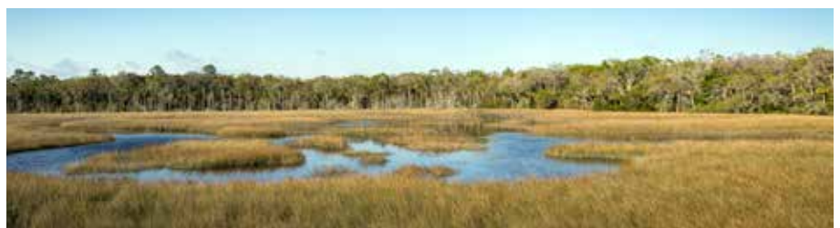
Above: Wetland habitat at Timucuan Ecological and Historic Preserve in Jacksonville, Florida

Climate change is creating conditions that allow for storms to become stronger. Increasing sea surface temperatures and the moisture-holding capacity of the air lead to more powerful tropical storms and hurricanes. 7 Storm surge, sea level rise, and heavy rainfall not only move water further inland but also prolong flooding and increase erosion. Built structures and lands that preserve cultural and historical heritage throughout Florida's national parks are highly threatened by extreme weather events. In Timucuan Ecological and Historic Preserve in Jacksonville, the historic Fort Caroline National Memorial and Ribault Monument are both threatened by