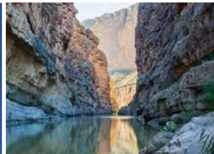
Left: Lorraine Hotel, Memphis, TN Above: The Rio Grande River running through Santa Elena Canyon at Big Bend National Park Bottom Left: Balcony House at Mesa Verde Below: Otter in Alaska