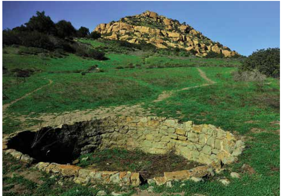
Above: The Santa Susana Mountains in the proposed Rim of the Valley contain numerous archaeological treasures related to early Native American settlements and Spanish colonial history.

The LA Field Office is also working on the creation of the César Chávez National Historical Park, which would build upon the existing César Chávez National Monument in Keene, CA. By incorporating several sites in California and Arizona, the new park will help interpret places critical to Chávez's personal development as a labor and civil rights leader, as well as other aspects of the 20th-century farmworker movement for respect, better wages, safer working conditions and collective bargaining rights. These sites include McDonnell Hall in San Jose, CA, where Chávez developed his skills as a community organizer, and the 40 Acres and Filipino Community Hall in Delano, CA,