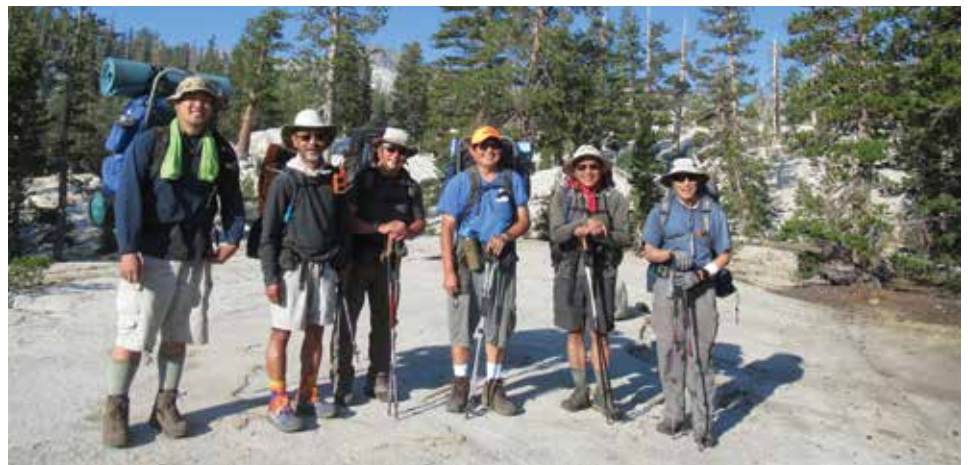
Below: The annual Yosemite Pilgrimage includes a backpacking trip to Sing Peak, named for the chef that was critical to the success of the Mather Mountain Party.

which served as the original headquarters of the United Farm Workers union and a center for Filipino American farmworker organizing, respectively. Also included would be the Santa Rita Center in Phoenix, AZ, which was the location of Chávez's highly publicized 1972 fast that brought attention to draconian labor laws, and the 1966 march route from Delano to Sacramento, CA that brought worldwide attention to the plight of farm workers throughout the West. We expect legislation establishing the new park to be introduced during this Congress.