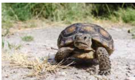
Below | Top Left: A desert tortoise in Nevada Bottom Left: Bighorn Sheep in Nevada Right: Purple Sky Highland Range, Avi Kwa Ame (Spirit Mountain)

To learn more and support the campaign, please visit honorspiritmountain.org/